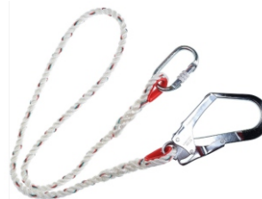
FP21 SINGLE LANYARD

This universal harness incorporates all fall arrest and protection needs in one. Features include two chest loops, two side D-rings, sliding dorsal D-ring, two seating loops and two lower back rings. Fully adjustable with shoulder, back and seat padding for extra comfort. CE certified