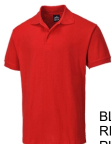
B210 NAPLES POLO SHIRT

This rugged polo shirt is made using pique knit polycotton fabric which is soft to touch and comfortable to wear. Features include a rib knitted collar and cuffs.