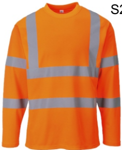
S278 HI-VIS LONG SLEEVED T-SHIRT

CE certified Moisture wicking fabric helping to keep the body warm, cool and dry Reflective tape for increased visibility Crew neck