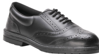
FW46 STEELITE EXECUTIVE BROGUE S1P

CE certified Protective steel toecap Steel midsole Energy absorbing seat region SRC - Slip resistant outsole to prevent slips and trips on ceramic and steel surfaces