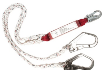
FP25 DOUBLE LANYARD WITH SHOCK ABSORBER

CE certified Superior strength Loops protected by abrasion resistant thimbles Suitable for a wide range of applications