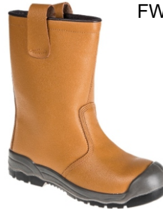
FW13 STEELITE RIGGER BOOT S1P CI

Outstanding rigger style with fur lining and added scuff cap for longevity of the boot. Steel toecap and midsole, dual density antistatic and oil resistant outsole. Ideal for those working in cold conditions. CE certified