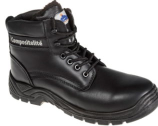
FC12 COMPOSITELITE FUR LINED THOR BOOT S3 CI

CE certified Composite toecap for added protection Anti-static footwear Energy absorbing seat region Water resistant upper to prevent water penetration