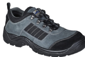
FW64 STEELITE TREKKER SHOE S1P

CE certified Protective steel toecap Steel midsole Anti-static footwear Energy absorbing seat region SRC - Slip resistant outsole to prevent slips and trips on ceramic and steel surfaces