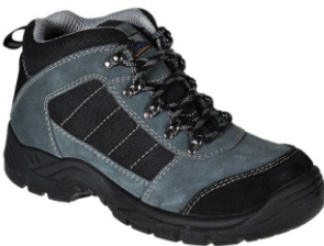
FW63 STEELITE TREKKER BOOT S1P

CE certified Protective steel toecap Steel midsole Anti-static footwear Energy absorbing seat region SRC - Slip resistant outsole to prevent slips and trips on ceramic and steel surfaces