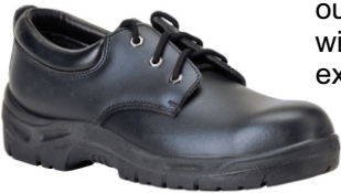
FW04 STEELITE SHOE S3

Provides exceptional protection. Superb dual density slip resistant outsole, steel toecap and midsole with a water resistant upper for an extremely durable safety shoe.