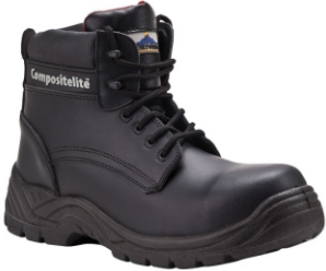
FC11 COMPOSITELITE THOR BOOT

CE certified Composite toecap for added protection Anti-static footwear Energy absorbing seat region Water resistant upper to prevent water penetration