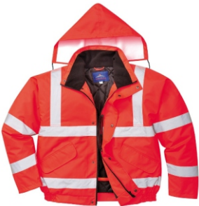
S463 HI-VIS BOMBER JACKET

The two-way front zip, studded flap and knitted storm cuffs provide ultimate protection. Taped seams to provide additional protection. Fleece lined collar to trap the heat and increase warmth. CE certified