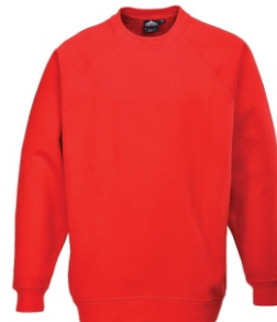
B300 ROMA SWEATSHIRT

BLACK - NAVY - ROYAL - DARK NAVY RED - GREEN - HEATHER - MAROON PURPLE - SKY BLUE - WHITE - YELLOW