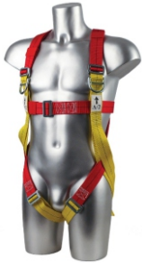
FP10 2 POINT HARNESS PLUS

Ergonomic, lightweight basic harness with a sliding dorsal D-Ring. Features two chest D-Rings and flat bar buckles that are easy to use and fail safe. Constructed using nylon webbing straps. The chest and leg adjusters offer excellent fit and user comfort. CE certified