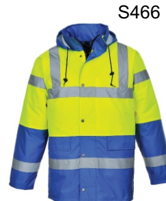
S466 HI-VIS CONTRAST TRAFFIC JACKET

Designed to keep you warm and dry whilst giving increased visibility, suitable for all weather conditions. Fully waterproof. CE certified.