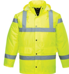
S460 HI-VIS TRAFFIC JACKET

This fully certified waterproof jacket is a popular option across many industries. Hard-wearing, functional, includes a drawstring hood, studded storm flap and multiple storage pockets. CE certified