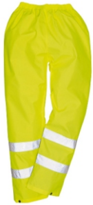
H441 HI-VIS RAIN TROUSERS

Like the Hi-Vis Rain Jacket, our Hi-Vis Rain Trousers are lightweight and extremely practical. They can be layered over the wearers own trousers for complete waterproof protection. CE certified