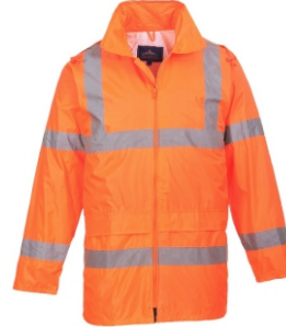
H440 HI-VIS RAIN JACKET

Designed to keep the wearer visible, safe and dry in foul weather conditions, the H440 is extremely practical and waterproof. 2 pockets for secure storage CE certified