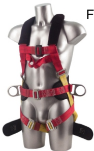
FP18 3 POINT HARNESS COMFORT PLUS

This full body harness, with a breathable contoured backpad, provides ultimate comfort and safety when working at height. Featuring an extended D-Ring shoulder strap arrangement for easy dorsal fittings and two side D-rings. CE certified