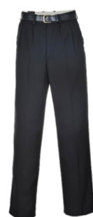
S710 LONDON TROUSERS

Made from high quality poly- viscose fabric, this modern trouser offers complete comfort and style. Two side pockets and a buttoned back pocket provide ample storage.