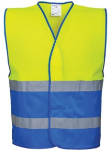
C484 HI-VIS TWO TONE VEST

CE certified Lightweight and comfortable Reflective tape for increased visibility Hook and loop closure for easy access Generous fit for wearer comfort