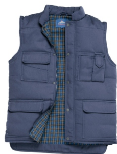
S414 SHETLAND BODYWARMER

The use of high quality polycotton fabric offers the comfort and durability necessary in today's work environments.