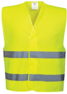
C474 HI-VIS TWO BAND VEST

CE certified Lightweight and comfortable Reflective tape for increased visibility Hook and loop closure for easy access Generous fit for wearer comfort Available in sizes up to 5XL