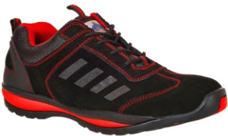
FW34 STEELITE LUSUM SAFETY TRAINER S1P HRO

CE certified Protective steel toecap Anti-static footwear Energy absorbing seat region SRC - Slip resistant outsole to prevent slips and trips on ceramic and steel surfaces