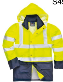
S496 SEALEX ULTRA TWO TONE JACKET

The unique lightweight material offers an unrivalled mixture of breathability, waterproof and windproof protection. The attached hood and studded storm flap are great features in bad weather. CE certified