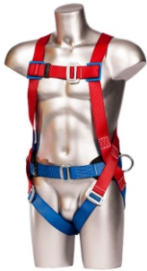
FP14 2 POINT HARNESS COMFORT

Lightweight harness with a sliding dorsal D-Ring. Features two chest loops and an adjustable quick release chest strap. Constructed using polyester webbing straps. CE certified