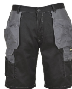
KS18 GRANITE HOLSTER SHORTS

The use of high quality polycotton fabric offers the comfort and durability necessary in today's work environments.