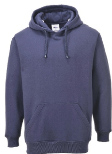
B302 ROMA HOODY

NAVY - BLACK - BOTTLE GREEN DARK NAVY - HEATHER MAROON - RED - ROYAL